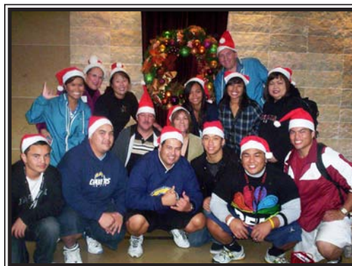
Where You Want to be Tours