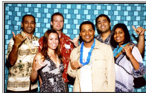
Wells Fargo, San Diego