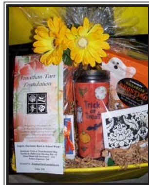
JTF Donated Raffle Baskets for Teachers