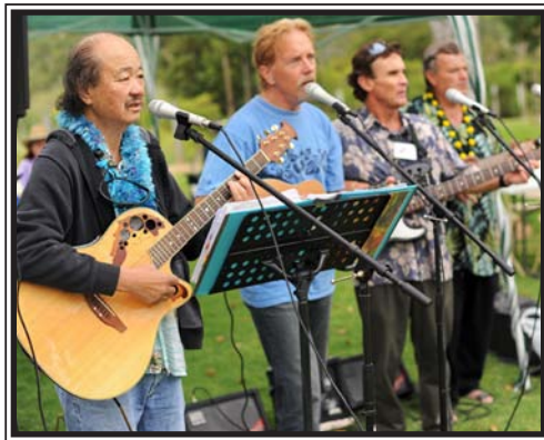
Moonlight Beach Ukulele Strummers