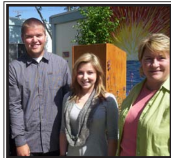
Sunset HS and North Coast HS Encinitas