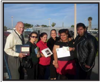
Palomar HS Chula Vista