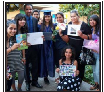
Chaparral HS El Cajon