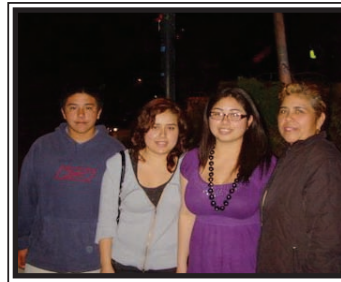
La Costa Canyon HS Carlsbad