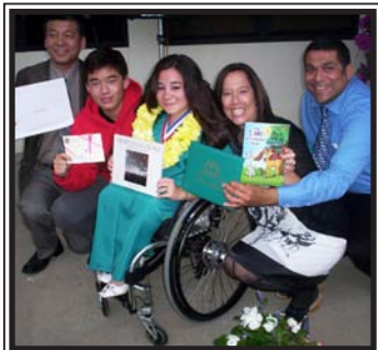
Palomar Vista HS Vista