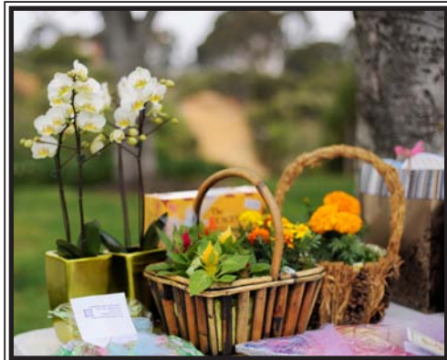
Fun Raffle Gifts