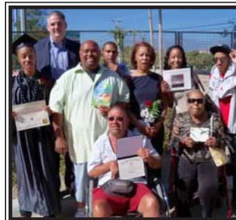
Oak Glen HS Valley Center