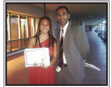
Morse HS San Diego