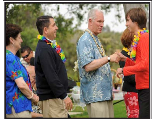
Dignitaries Greet Students