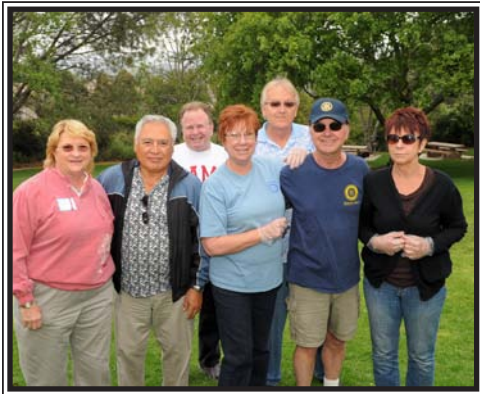
Encinitas Rotary Club