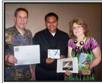
Valley Center HS Valley Center